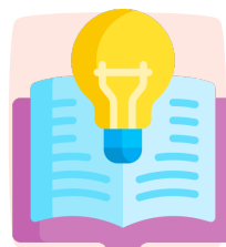
Grammar & Vocabulary