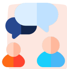
Listening & Speaking