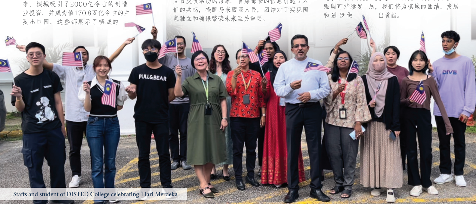
Staffs and student of DISTED College celebrating 'Hari Merdeka'

在立达学院，我们将继续秉承首席部长的愿景，通过研讨会提倡多元化、促进公民参与、鼓励负责任地使用社交媒体以及举办团结庆祝活动。通过灌输领导技能、发起合作研究、提供奖学金和强调可持续发展，我们将为槟城的团结、发展和进步做出贡献。