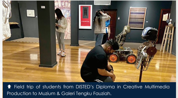
↑ Field trip of students from DISTED's Diploma in Creative Multimedia Production to Muzium & Galeri Tengku Fauziah.

Lecturer, School of Computing & Engineering