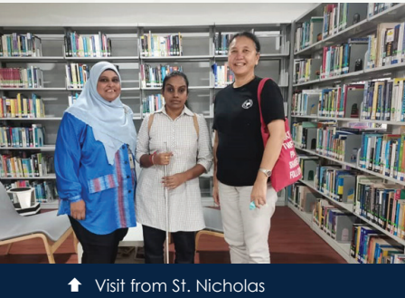
↑ Visit from St. Nicholas