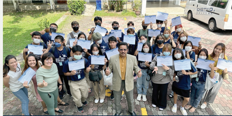
↑ The Thai delegates with DISTED President and Head of Student Affairs.

The students also participated in a treasure hunt, promoting teamwork and coordination among team members. Following