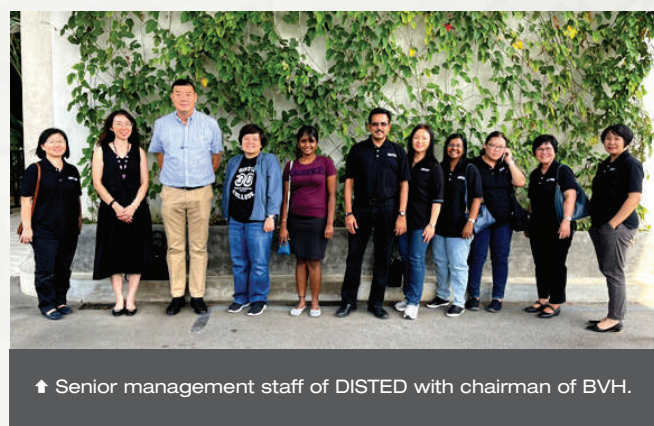
↑ Senior management staff of DISTED with chairman of BVH.