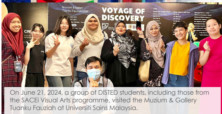
On June 21, 2024, a group of DISTED students, including those from the SACEi Visual Arts programme, visited the Muzium & Gallery Tuanku Fauziah at Universiti Sains Malaysia.