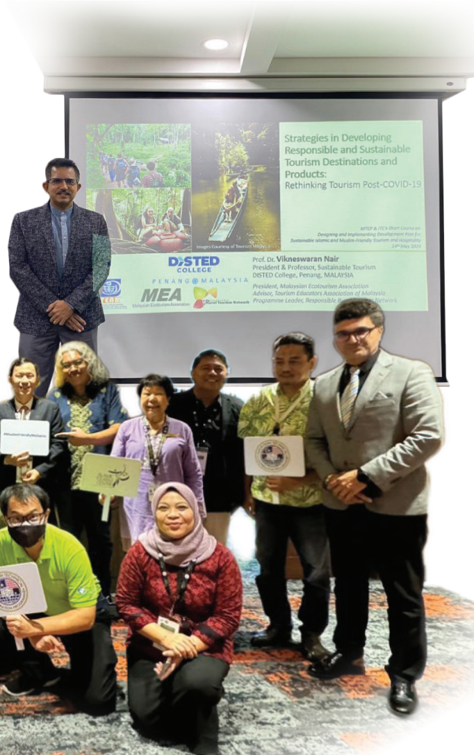
Participants of the Programme